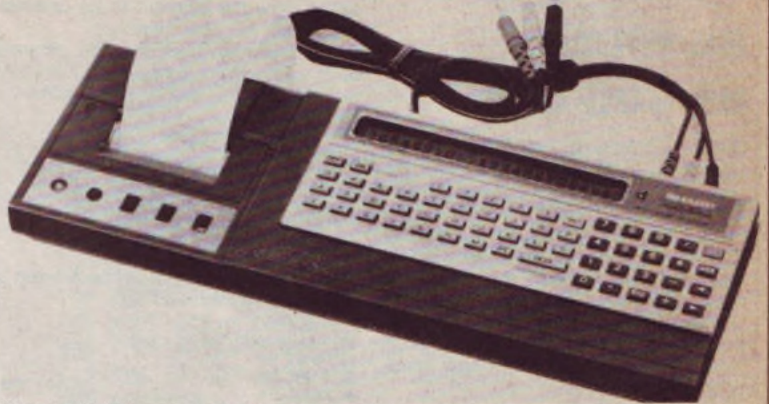
Sharp's PC1211 . . . the secret is to use variables efficiently.

On a similar note, Z=M is about 0.02 seconds faster than A=M, and M=A is about 0.02 seconds faster than M=Z. It therefore pays to have the higher variable on the left of an assignment, and the lower variable on the right. This does not apply to variables above Z, which seem to take longer.