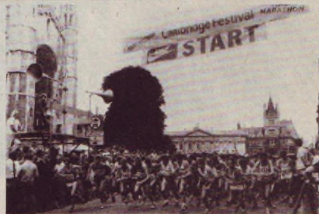
And they're off . . . looking for their Spectrums?

"Our objective is to enable teachers to get started in giving all young pupils — the five-to ten-year-olds — experience with technology," concluded Kenneth Baker.