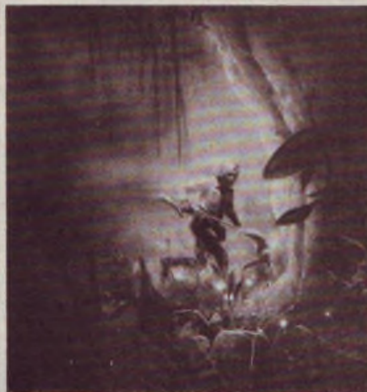
Cover illustration by Ian Craig