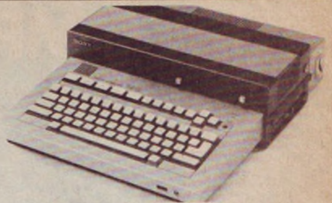
Sony's SMC-70 microcomputer with dual disc-drive unit.

To ensure that this video facility is useful the SMC-70 has advanced graphics capabilities. The 16-colour mode will display either four pages of 160 x 100 pixels or one page of 320 x 200 pixels. The hi-resolution black-and-white mode will display a page of 640 x 400 pixels.