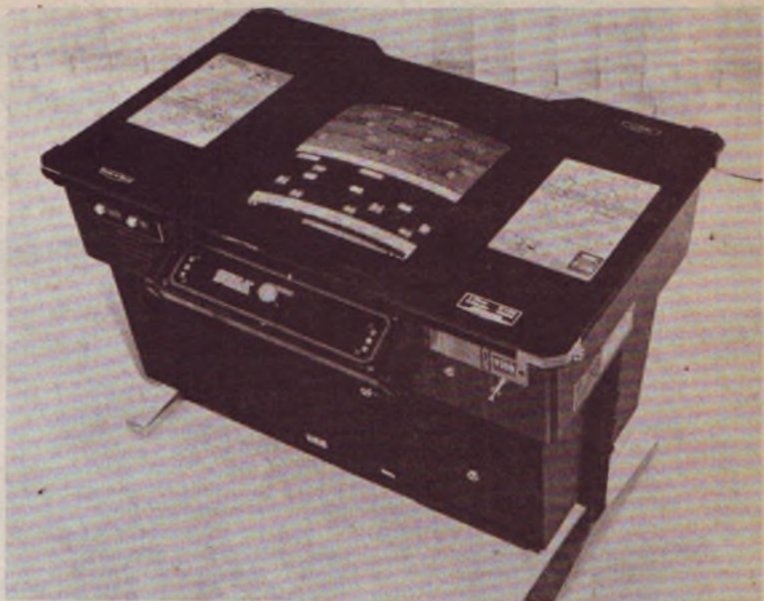
Sega's Frogger . . . at the centre of an important legal battle to establish copyright.

For this reason a look at the amusement industry copyright battle is worthwhile. So far, all the hearings in the High Court have been interim claims for injunctions to stop alleged piracy, pending the full trial of